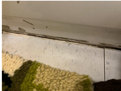
1912-4 12"x12" Floor Tile/Adhesive Interior Bathroom/Family Room