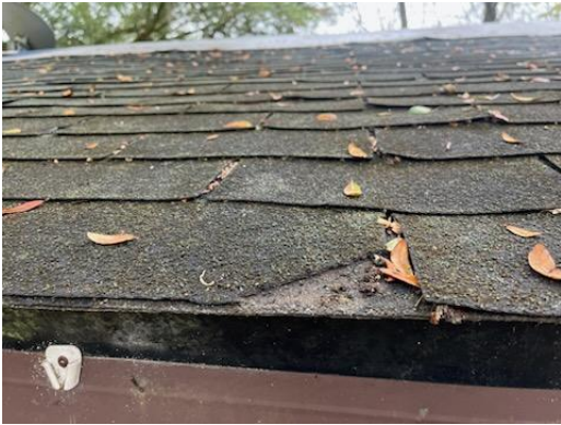
1912-1 Asphalt Shingle Typical Exterior Roof