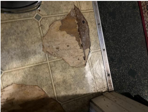
1912-3 Rolled Flooring Interior Kitchen