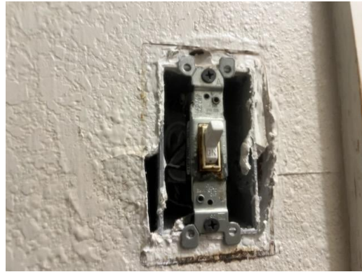
1912-2 Drywall/Joint Compound/Caulk Typical Interior Walls/Ceilings